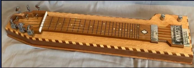
Lap Steel Guitar